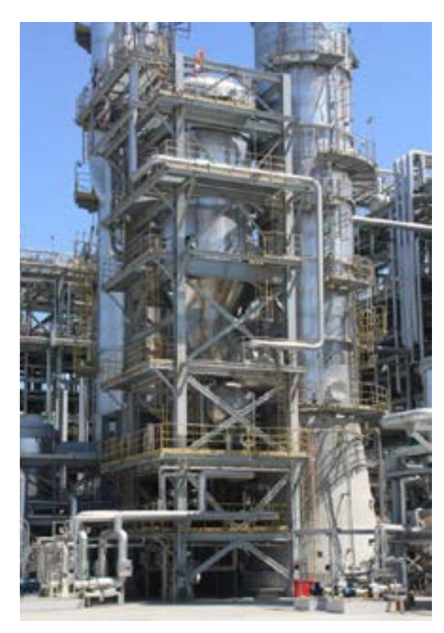
PetroChina Dushanzi Petrochemical Company's 320 KTA EB/SM Plant

TotalEnergies Refining & Chemicals' research facilities, together with the five operating units of TotalEnergies, are invaluable resources to the development and commercialization of styrene process improvements. Access to the operating plants also allows for demonstration of new or innovative concepts such as DHU.