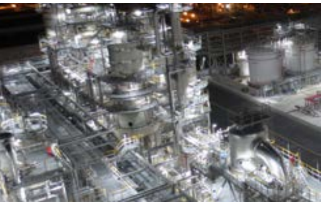
Cumene plant at night